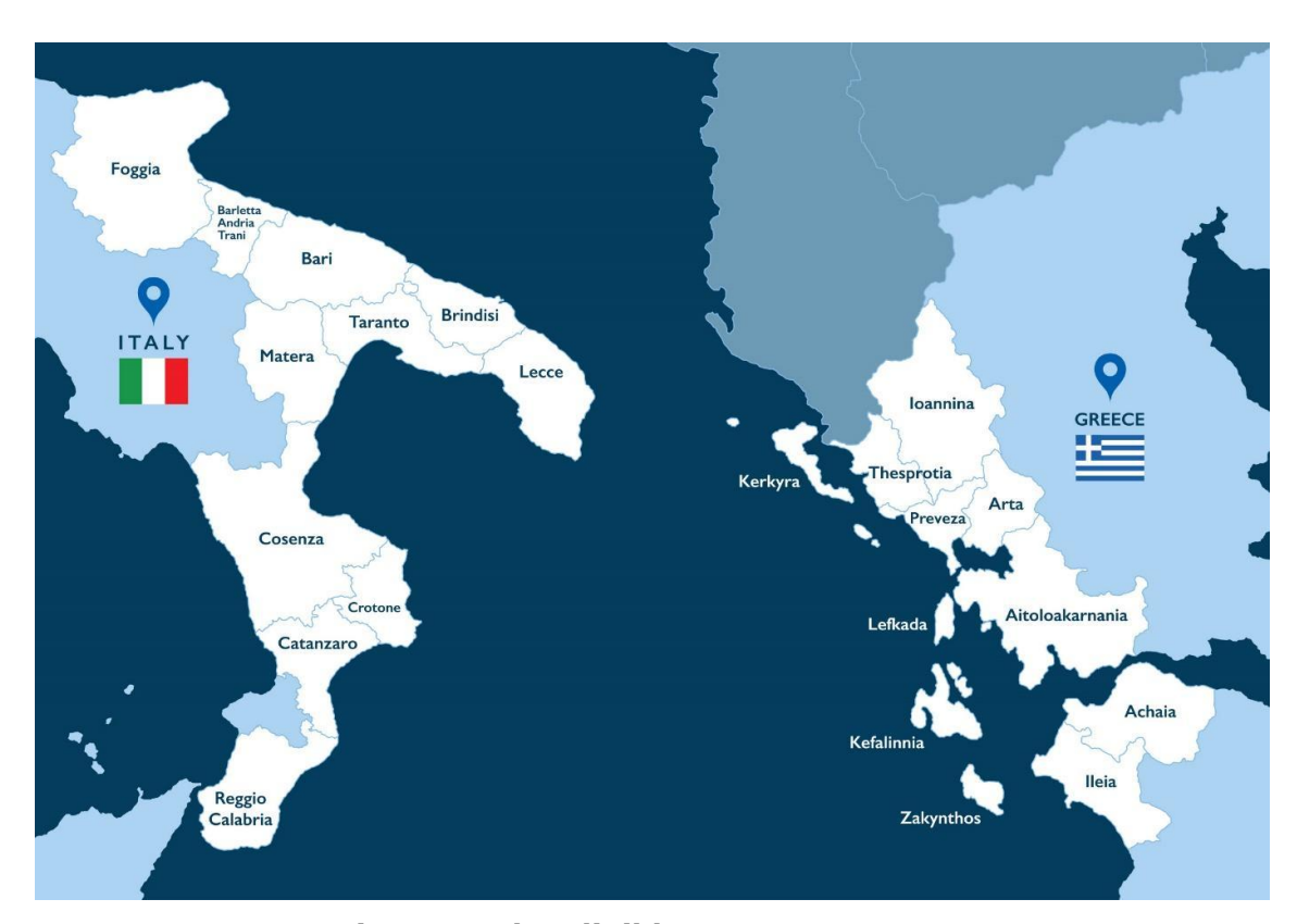
Figure 1: The Eligible Programme Area

The Programme covers the following eligible regions: